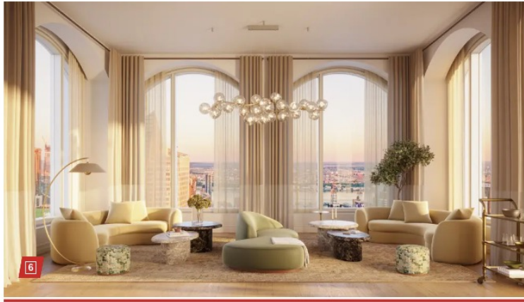
Sales inside the address have been moving briskly. Alden Studios

“It’s a very generous two-bedroom,” Puzio said. “It has 2,562 square feet of interior space,” and she added its high elevation is “a huge selling point.”