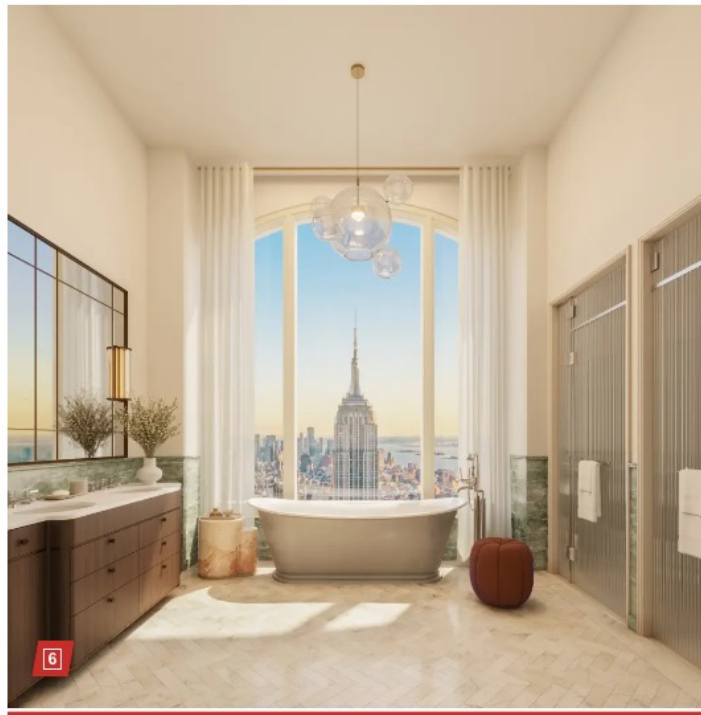
A spa-like bath retreat in the unit looks out to the Empire State Building.