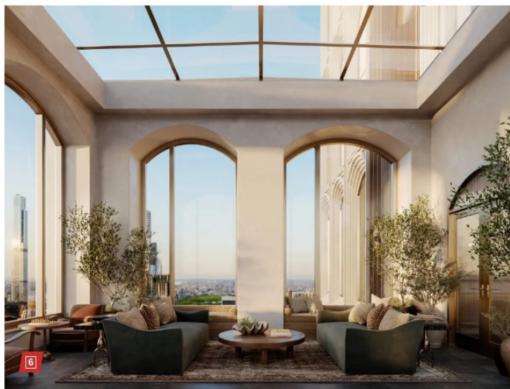
The amenities at 520 Fifth are also perched quite high, as seen in this solarium. Binyan Studios