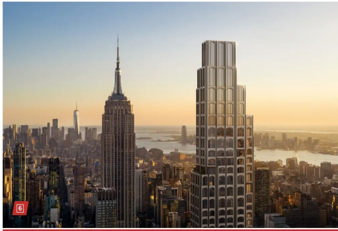
520 Fifth Ave. topped out in the fall, and is slated to open next year. Binyan Studios