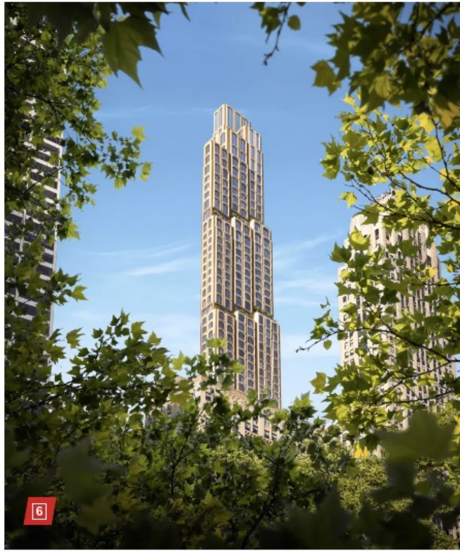
It's the tallest residential structure along Fifth Avenue.