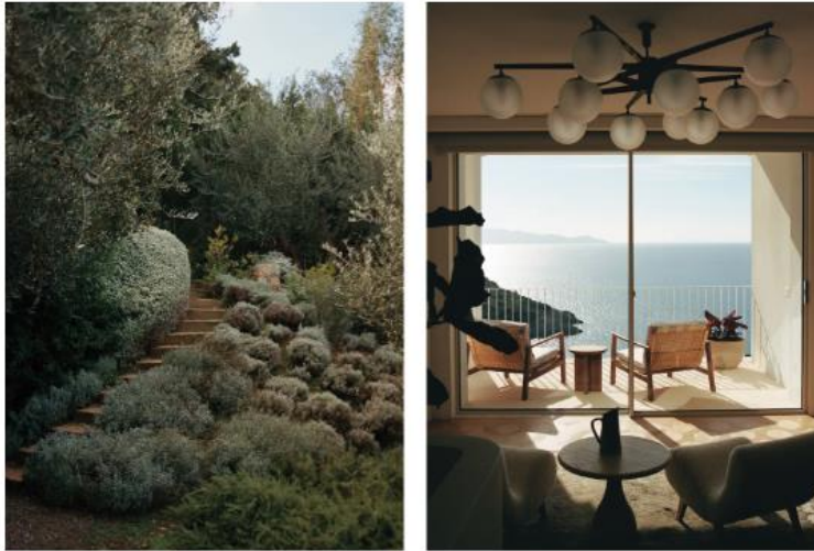
THE ITALIAN JOB