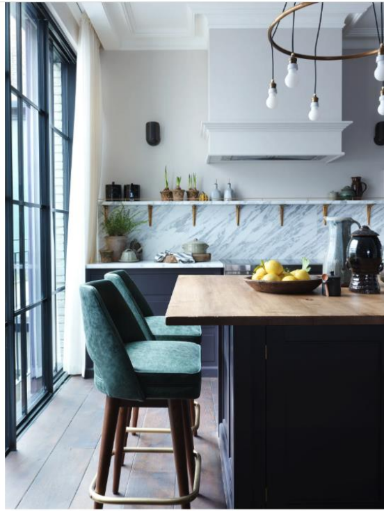
The kitchen of the Marylebone home.